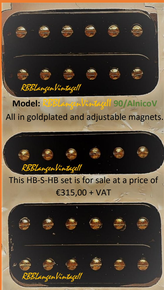
Model: RBBlangenVintagell 90/AlNiCo V All in goldplated and adjustable magnets.

The RBBlangenVintagell 59/AlNiCo handmade set of HB-S-HB pickups, with mixed AlNiCo II and V pickups, are hand wound with a scatter winding pattern, and very well balanced and calibrated. This handmade exclusive pickup's is also for separately sale and fit most of the top-brand-guitars. See info next page.