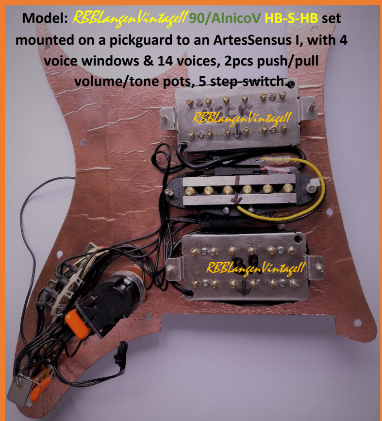
Model: RBBlangenVintagell 90/AlNiCo V HB-S-HB set mounted on a pickguard to an ArtesSensus I, with 4 voice windows & 14 voices, 2pcs push/pull volume/tone pots, 5 step-switch.

This HB-S-HB set is for sale at a price of €315,00 + VAT